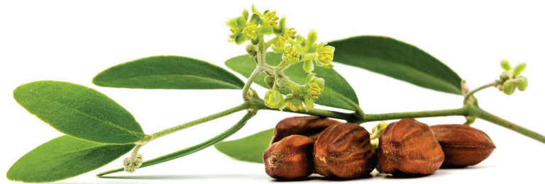
Figure 1. Jojoba seeds – The seeds contain jojoba oils that is in fact a wax ester

Traditionally, waxes are extracted from plants (Jojoba oil) and animals (Spermaceti, beeswax). Today, extraction of wax esters from natural materials are too expensive or scarce to meet the commercial demand. Industrial synthesized waxes are produced by direct chemical esterification at high temperature in presence of an inorganic catalyst. This non-selective high-energy route tends to produce waxes with coloration and odor, which needs further processing to yield a colorless and neutral end product.